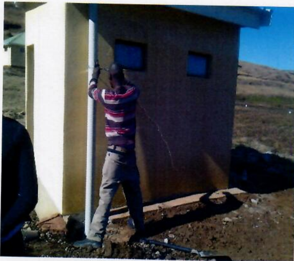
Back view picture