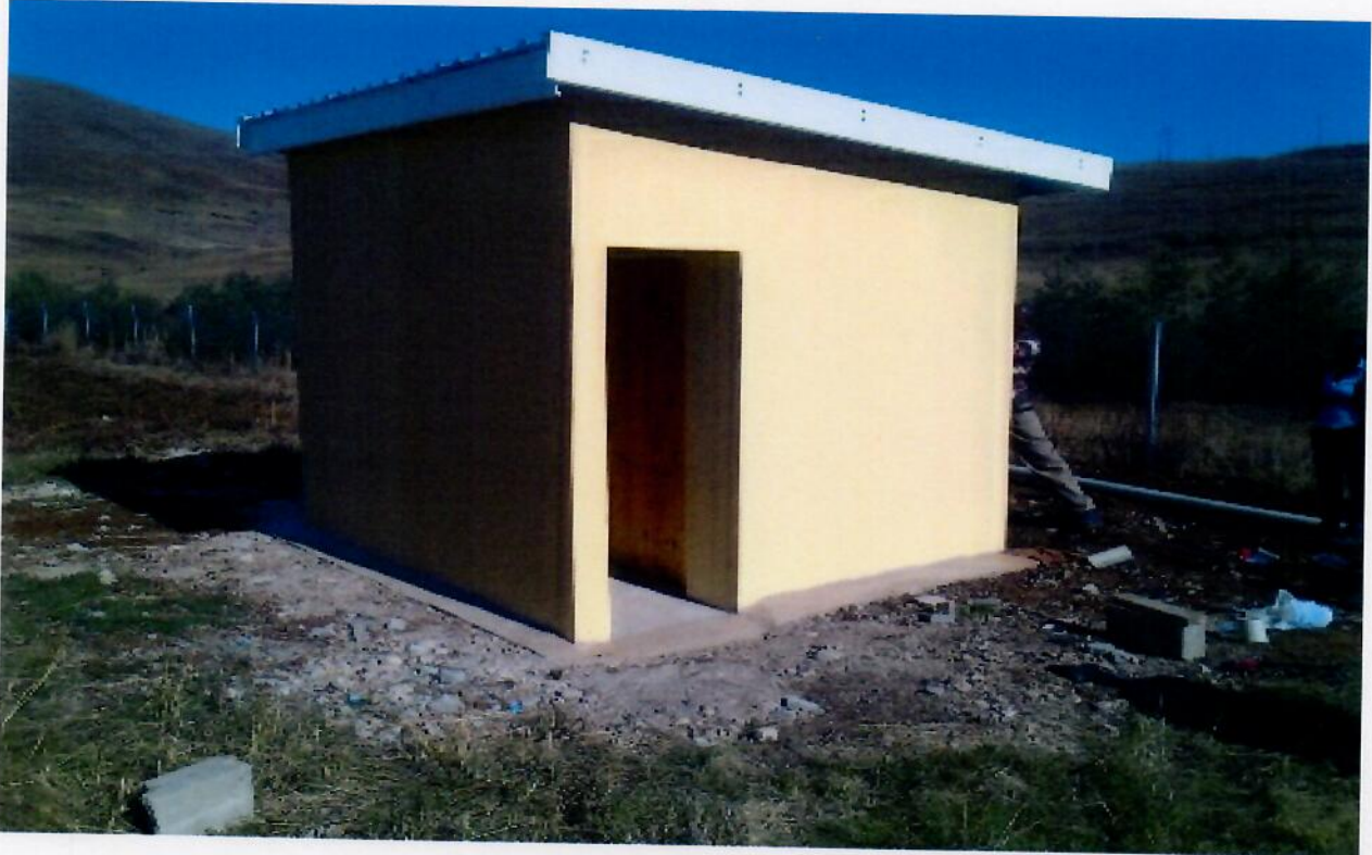
Front view picture