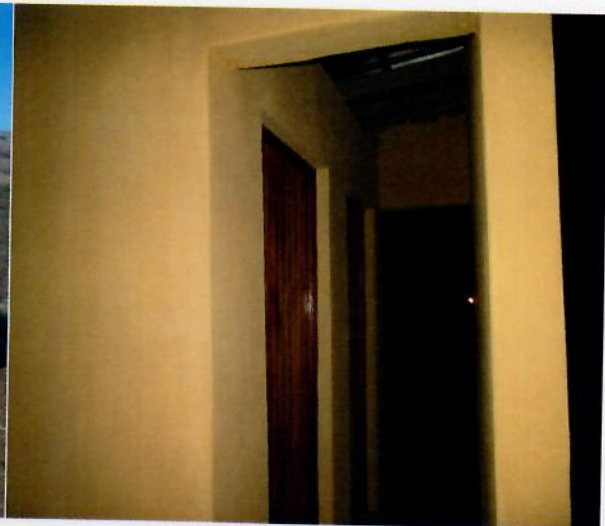
Side view picture